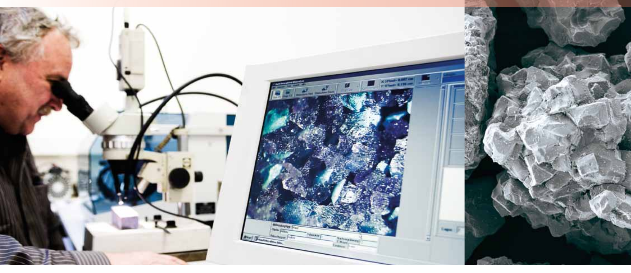
Microscopic structure testing.