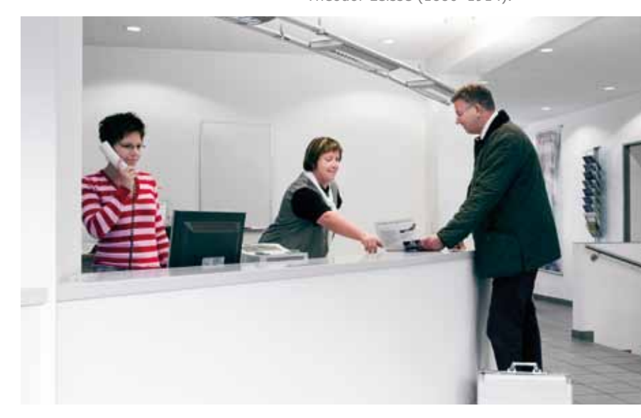
Reception at the company headquarters.